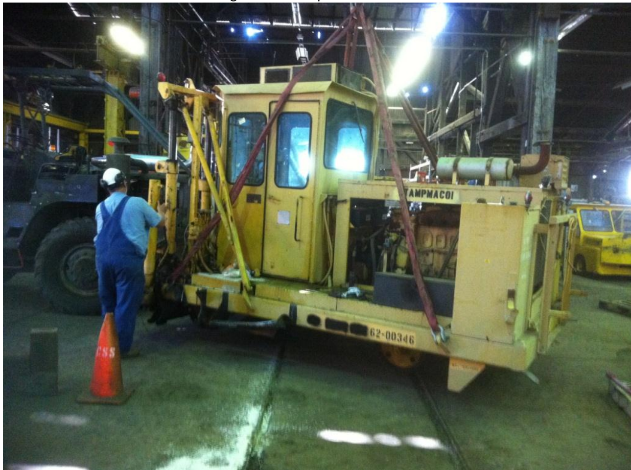
The "new-old" tamper flies!