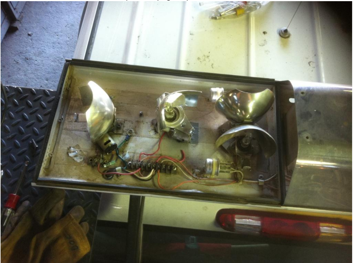
The trusty Chevy Truck's safety light bar on the roof of the cab disassembled for repair