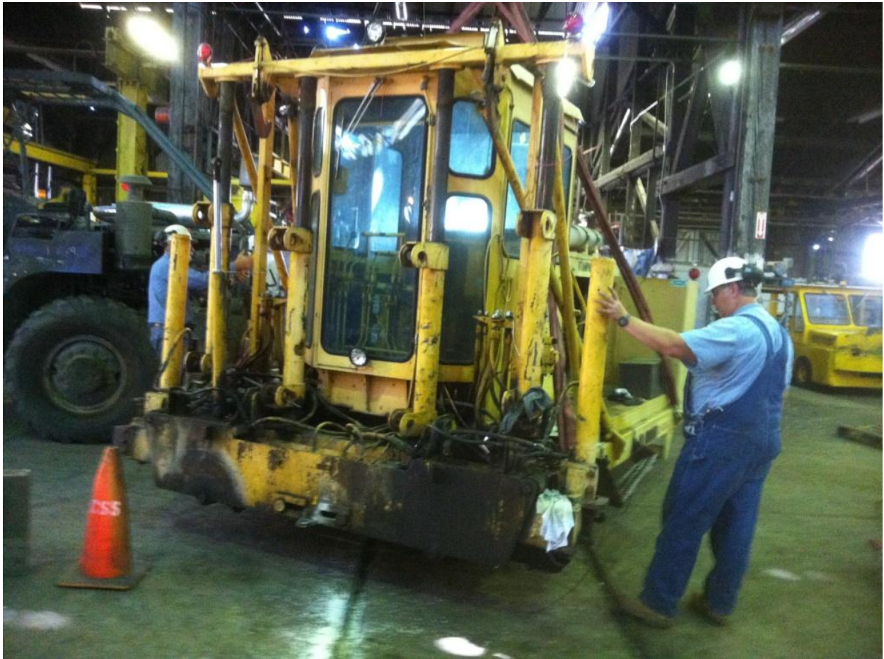
Alan and Chris spin the flying tamper and line it onto the rails