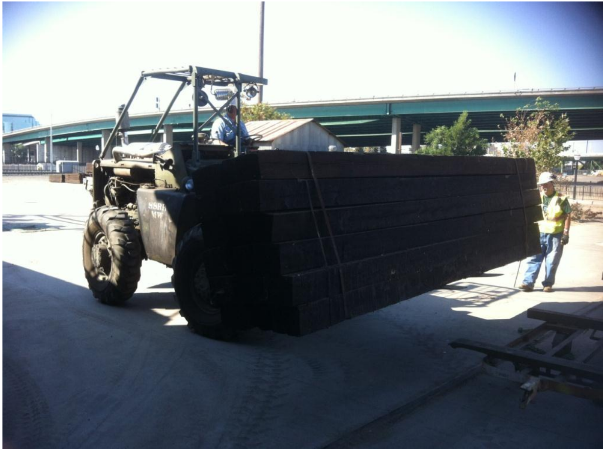
Chris on Big Green takes possession of the 16' ties