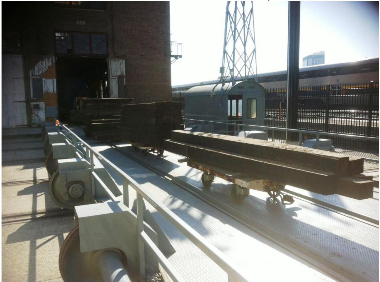
Bundles of ties arranged on the transfer table for transferring